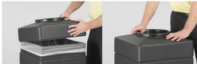
Step 3 Place lid over top