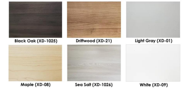
Domestic Laminate Options