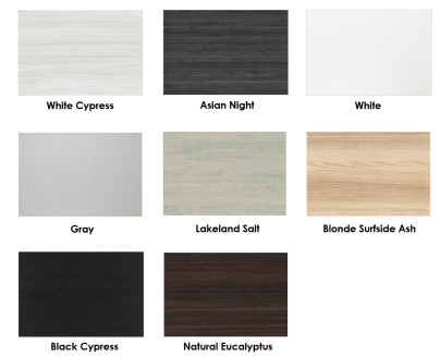
Domestic Laminate Options